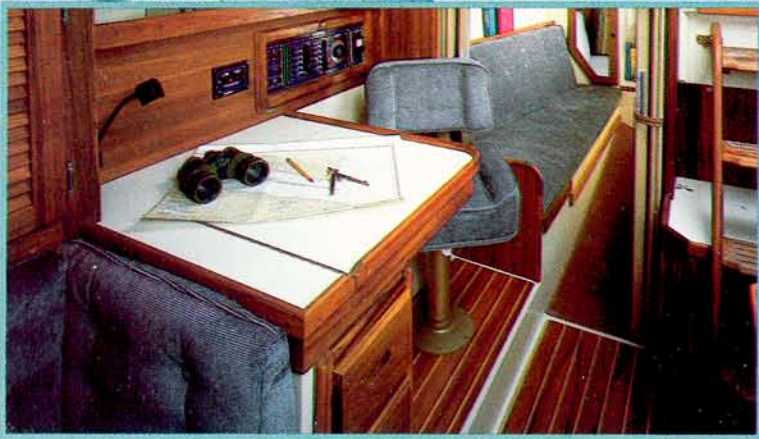
The navigation desk and chair.

The accommodation plan of the 36 is designed to reflect the needs of the sailing family who has learned how to enjoy their leisure time afloat to the fullest.