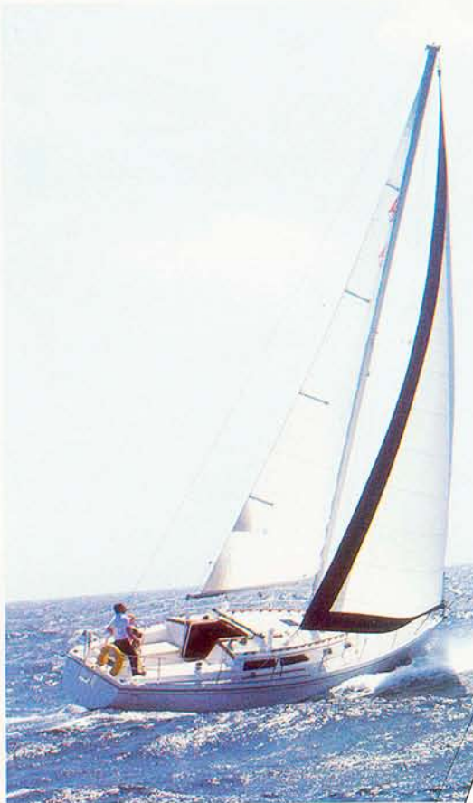
Photo and drawings may show optional equipment. Refer to a current retail price sheet for standard equipment list and specifications.